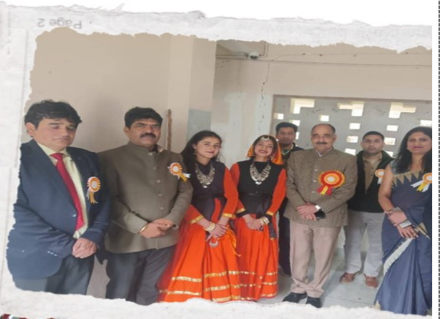
Annual Prize Distribution Function